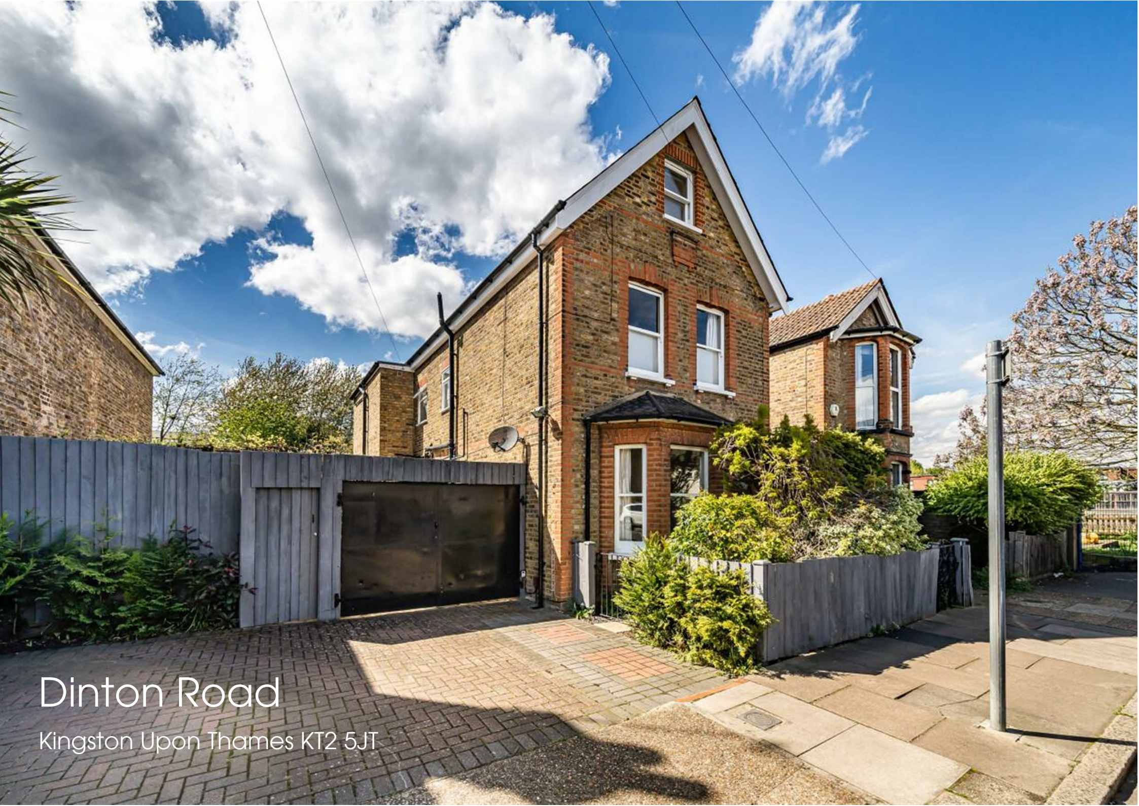
Dinton Road Kingston Upon Thames KT2 5JT

34 Richmond Road Kingston upon Thames Surrey KT2 5ED www.gibsonlane.co.uk Tel: 020 8546 5444